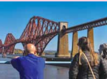
The Forth Bridge