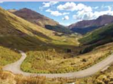
Rest And Be Thankful