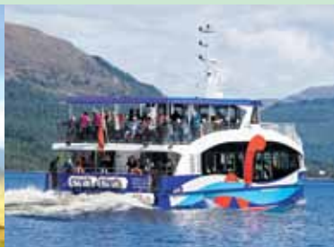
Loch Ness Cruise

Relaxing music will be played during your comfortable drive back to Edinburgh. Price is for transport and guided bus tour only. Times shown are approximate. This tour is not suitable for younger children.