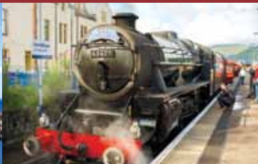
The Jacobite at Fort William