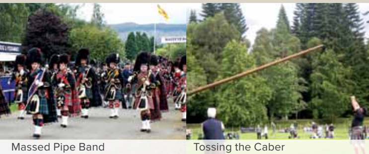
Massed Pipe Band

Leaves at 7.30am, arriving back at 7.30pm